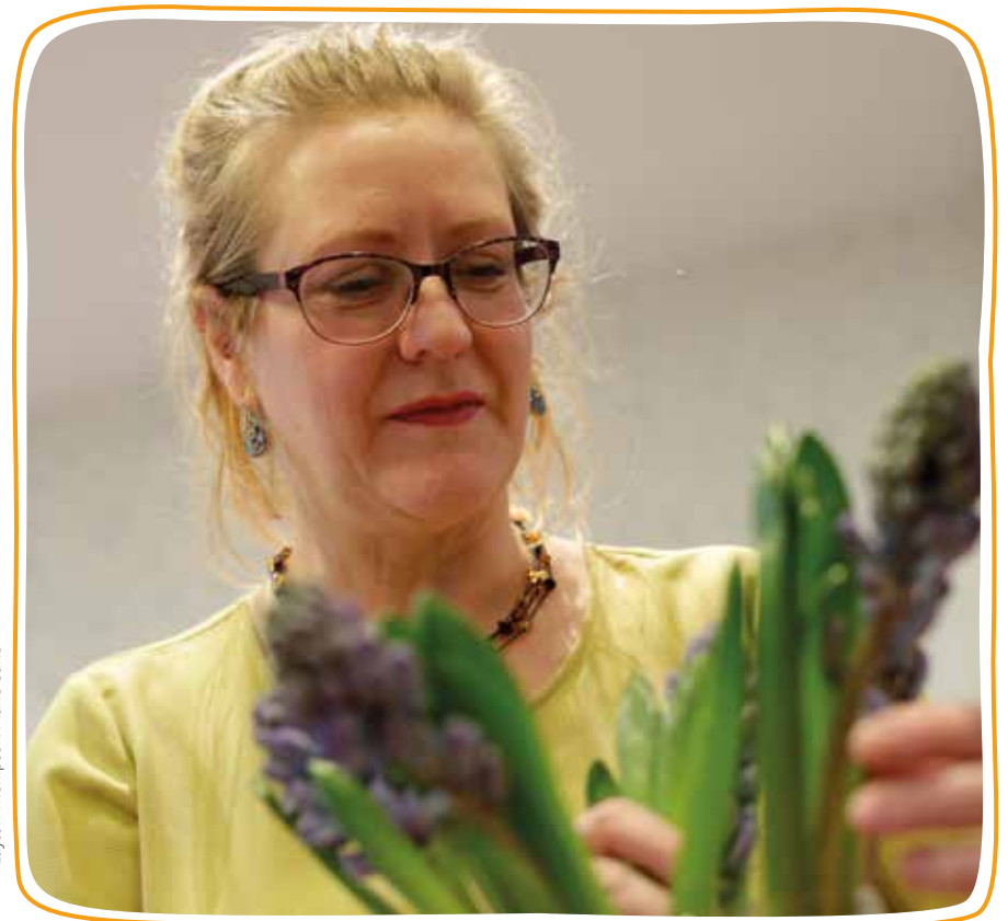
Layton Thompson/Marie Curie

Being a carer can be both physically and emotionally draining. Carers are more likely to experience physical and mental health problems than people without caring responsibilities, like back pain, anxiety and depression. However, there are things that you can do to look after your own health, and support is available if you feel unable to cope.