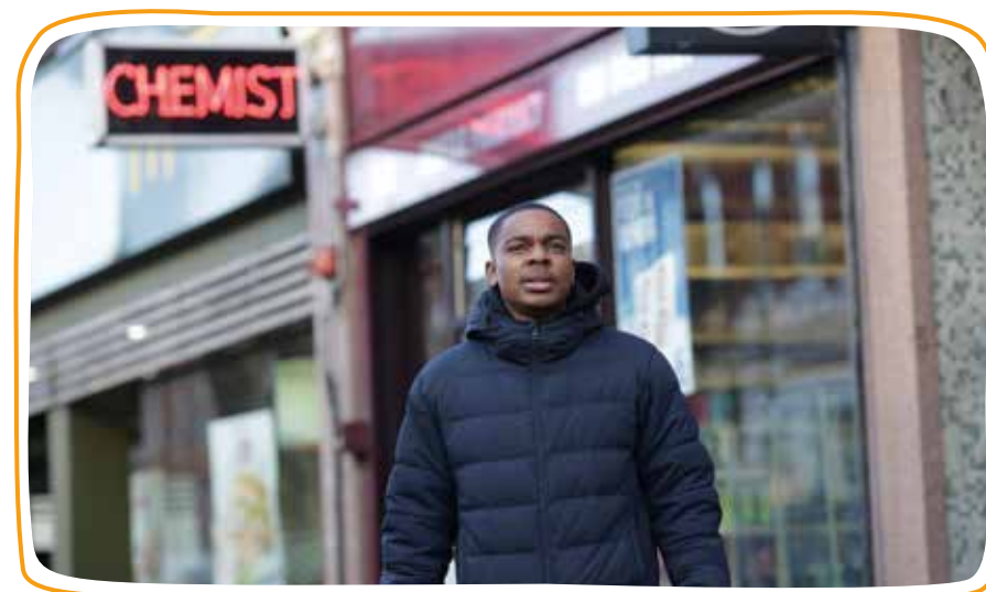
Layton Thompson/Marie Curie

We have more information about pain relief and side effects in our booklet Controlling pain and on our website at mariecurie.org.uk/pain You can also call the Marie Curie Support Line on 0800 090 2309 .*